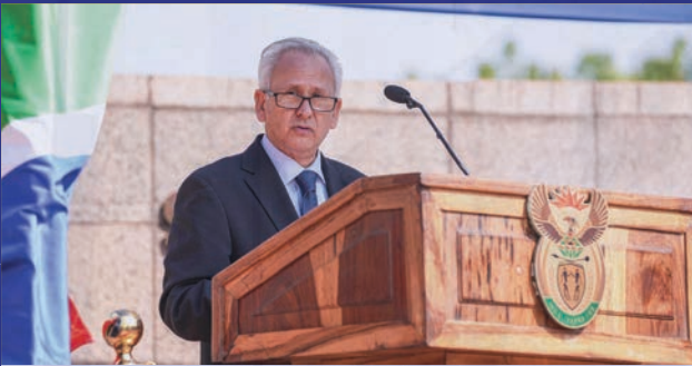
Acting Minister of Police, Prof Firoz Cachalia delivering his opening address during the SAPS National Commemoration Day.

The Acting Minister of Police further urged police members to remain vigilant while discharging their policing duties and encouraged the citizens to continue protecting police members from danger. “You have been trained to protect yourselves in the execution of your duties. Look after each other’s safety and where you see shortcomings that could undermine your safety and those of your colleagues, please speak up and use the available channels to communicate these. As citizens, let us support the men and women in blue who continue to serve with integrity and bravery, so that South Africa may be a safer, more just country for all.”