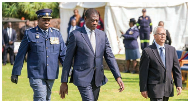
Deputy President Paul Mashatile being ushered by the National Police Commissioner, Gen Fannie Masemola and the Acting Minister of Police, Prof Firoz Cachalia to officiate the annual SAPS National Commemoration Day at the Memorial Site in the Union Buildings, Pretoria.

In addition, he conveyed profound sympathy from the national government to families, especially spouses and children of the fallen police officers who continue to carry a heavy burden of grief. He encouraged them to remain strong and assured them that the government recognises the great sacrifice made by their dearly beloved in the protection of the citizen of the country and its democracy.