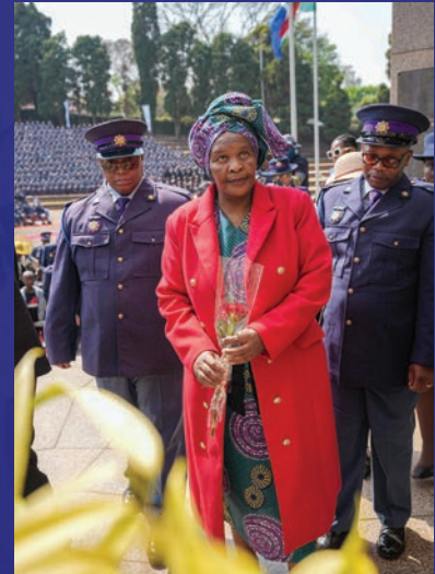
Family members of the 27 men and women in blue who perished in the line of duty, laid roses in remembrance of their loved ones at the SAPS Memorial Site, in the Union Buildings.

The sounding of the last post, the half-masting of the national flag and the fly-past of the SAPS Air Wing was the highest honour bestowed on 27 fallen SAPS members, for their ultimate sacrifice of putting their lives on the line and protecting the citizens and the democracy of the Republic of South Africa. These brave fallen members were remembered during the annual SAPS National Commemoration Day for the 2024/2025 financial year, on 7 September 2025 at the Memorial Site in the Union Buildings, Pretoria.