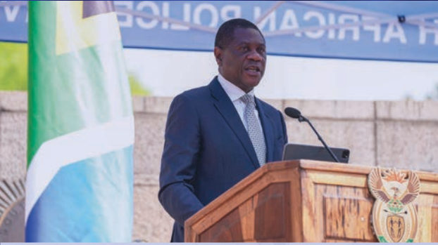
Deputy President, H.E. Paul Mashatile delivering his keynote address during the SAPS National Commemoration Day at the Memorial Site of the Union Buildings in Pretoria.

The Acting Minister of Police further urged police members to remain vigilant while discharging their policing duties and encouraged the citizens to continue protecting police members from danger. “You have been trained to protect yourselves in the execution of your duties. Look after each other’s safety and where you see shortcomings that could undermine your safety and those of your colleagues, please speak up and use the available channels to communicate these. As citizens, let us support the men and women in blue who continue to serve with integrity and bravery, so that South Africa may be a safer, more just country for all.”