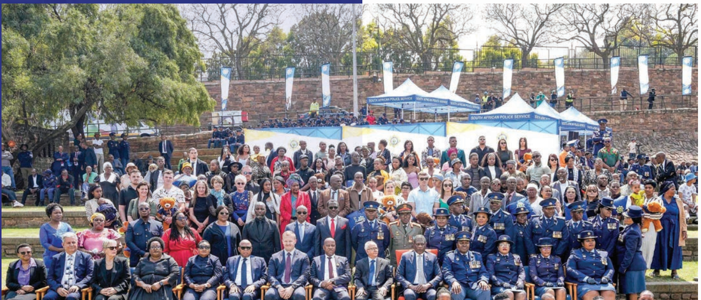
Deputy President Paul Mashatile flanked by the Acting Minister of Police Prof Firoz Cachalia together with the SAPS leadership, Members of the Portfolio Committee on Policing and various stakeholders, with family members of the 27 police officers who died in line of duty.